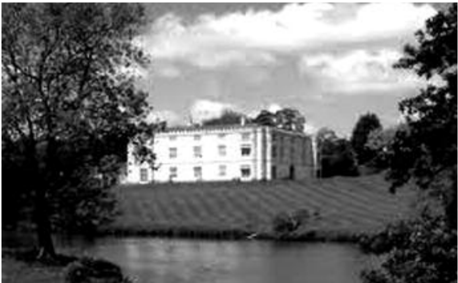
Eastwick Manor /Southey Boys School Abandoned

It was sad to see what had once been a majestic house stand empty and abandoned and fast going into decay. Modern development has led to the whole area becoming the Eastwick housing estate. The sole sorry remains of the once majestic house are