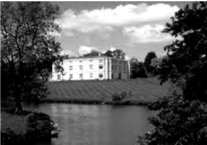
Great Fulford House, Dunsford

The original school in Worthing was purchased and became 'Southey Hall Hotel' and in 1953 was converted to flats and called 'Southey Hall Flatlets'. It is still a block of flats but it is now known as 'Dolphin Court'.