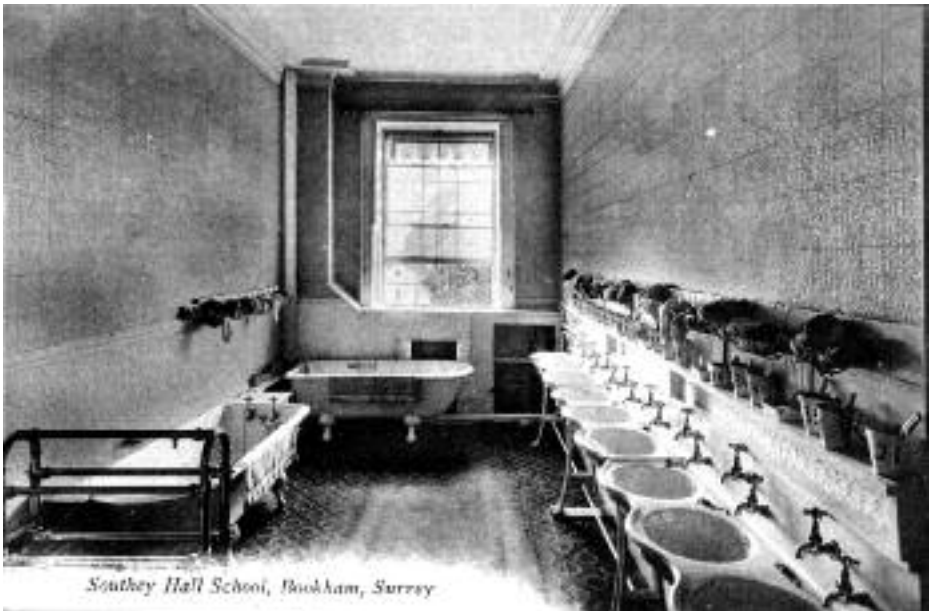
Southey Hall School, Bookham, Surrey

Being under the roof posed risks and our fire drills took us along corridors and platforms round the roof to fire escapes should we be unable to flee by the usual stairways. The final resort was an outer window pulley block, which regulated a canvas strap and loop to lower individual boys to the ground at safe descent speeds, but all rather slow if a bad fire had caught hold. Thank goodness this system was never tested for real. All windows were uncurtained and being under the tiles the room was very cold in winter and hot in summer. Of course, in those times we all slept in full flannelette pyjama suits. Our beds were made and chamber-pots emptied by domestic staff while we were in morning class. As a junior master lived in the corner bed-sitting room next to us we all had to behave and make no noise, especially after the Headmaster, or a Duty Master, looked in to extinguish the lights. One summer term we indulged in a midnight dormitory feast, building up a store of sweets saved from our weekly rations and kept under a floor board. It was all rather tame, though we had to be very quiet to avoid waking Mr Fussell below us. We went to and from our