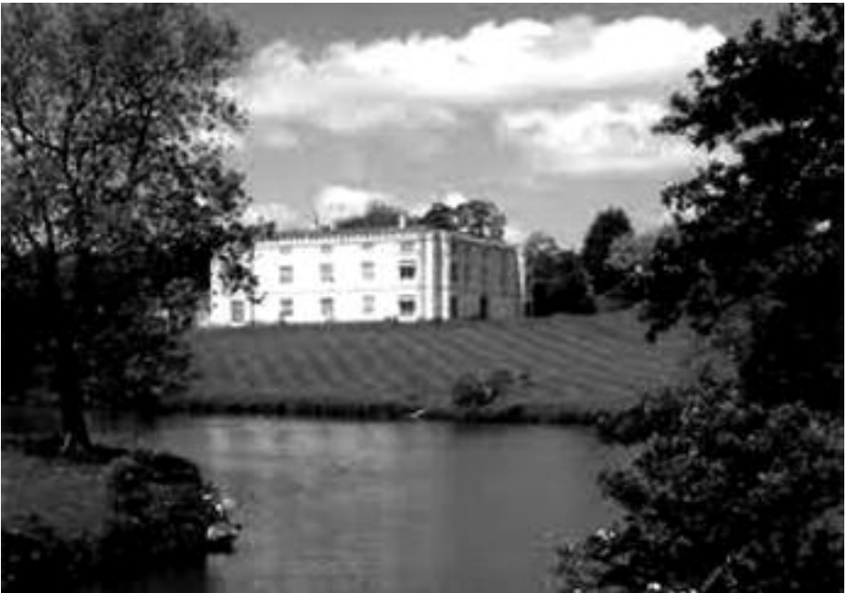
Great Fulford Manor

Great Fulford is a fortified manor house and has apparently been owned by the Fulford family continuously since at least 1190 and as given by Richard the Lion-Heart to a Fulford in recognition of gallant service in the Crusades. The present building was erected in the early 16th Century. It was besieged in the Civil War and shelled by the Parliamentarian forces. In the classrooms there were quite a few paintings, mostly of bosomy women ancestors with massive cleavages. Mainly of the Stuart era I think I fear that some of them may have been despoiled to some extent by boys flicking from